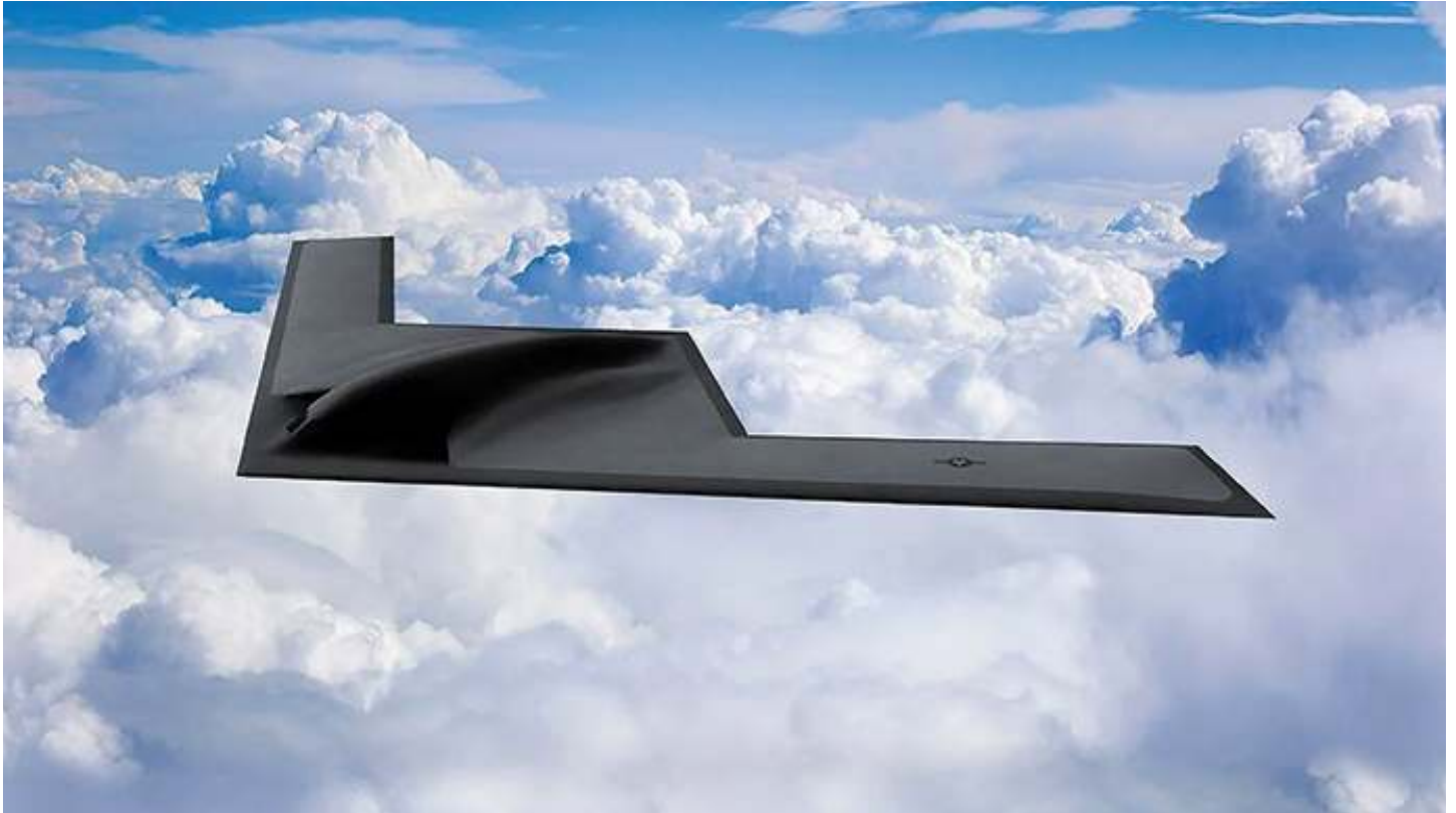
Figure 15: Image of B-21 Artist render: „An artist’s rendering of a B-21 Raider in flight”

Some targets, like the J-20 production sites at Chengdu, the submarine construction sites in Wuhan or Beijing itself are also too far inland for some cruise missiles to hit. Less of a concern to the planning of an attack route against China is the stated max range of the B-21. An asset like the B-21 would certainly be air-refueled at least once in a given mission, extending its range into the theoretically infinite and making its approach vector highly unpredictable. B-2 bombers have flown 30 hours non-stop mission from mainland US to Yemen and back to hit Houthi targets in the Gulf of Aden. For these reasons, the B-21 is still very relevant against China, even with a vast anti-air missile array. The US could use its large number of military satellites to map out the location of Chinese SAM-sites and air-defense radars, planning routes with the least amount of coverage, such as gaps near the Chinese shoreline. Alternatively, the B-21 could overfly less well defended areas such as taking a detour through North Korean air-space with its much less capable air defense or routes from mainland US over the sparsely populated and even less defended Russian tundra, approaching China from the North unexpectedly (Binkov, 2025b).