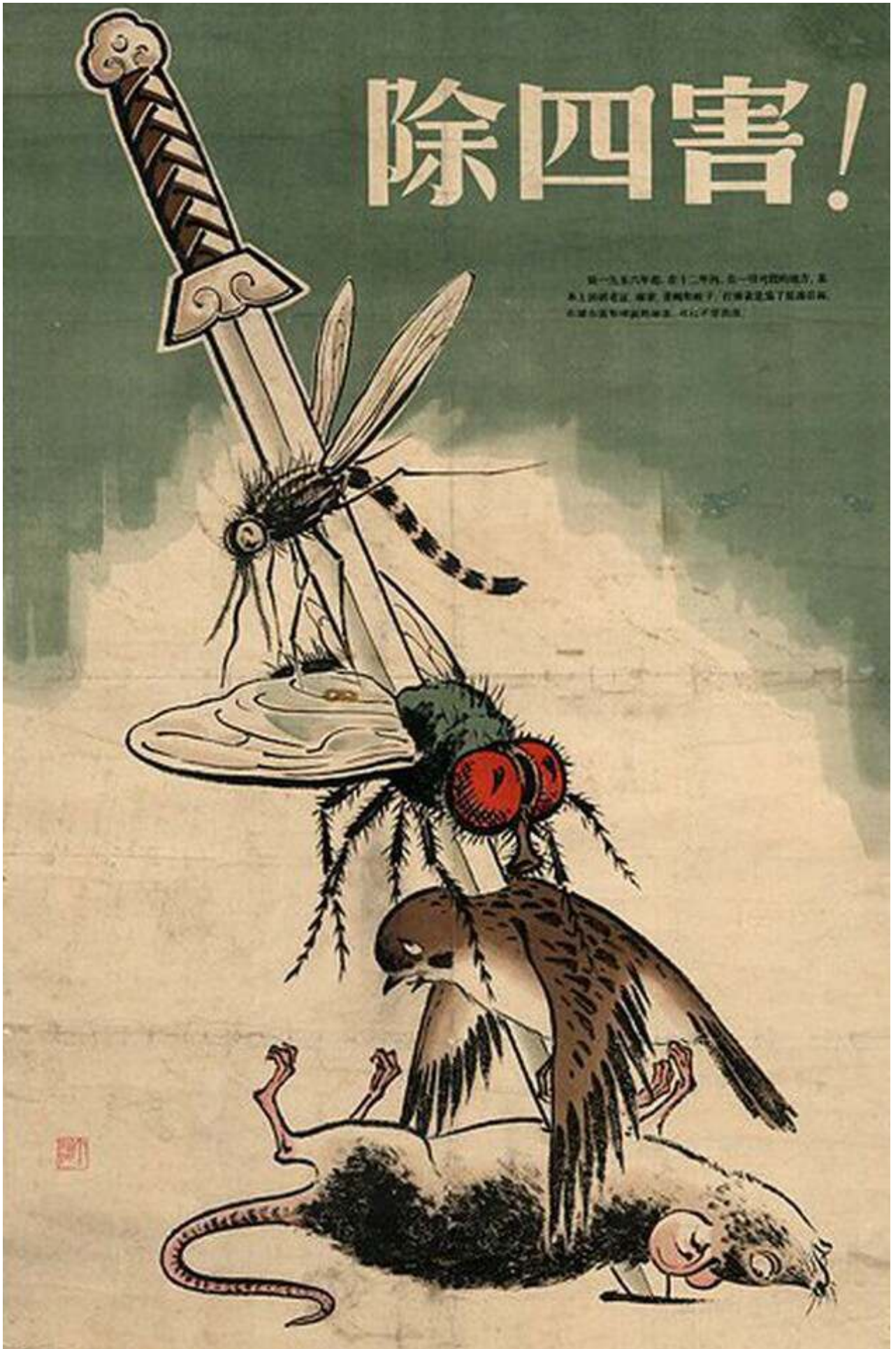
Figure 19: Image of the four Pests: "Chinese poster reading "Exterminate the Four Pests" from 1958, picturing the sparrow, rat, fly and mosquito"