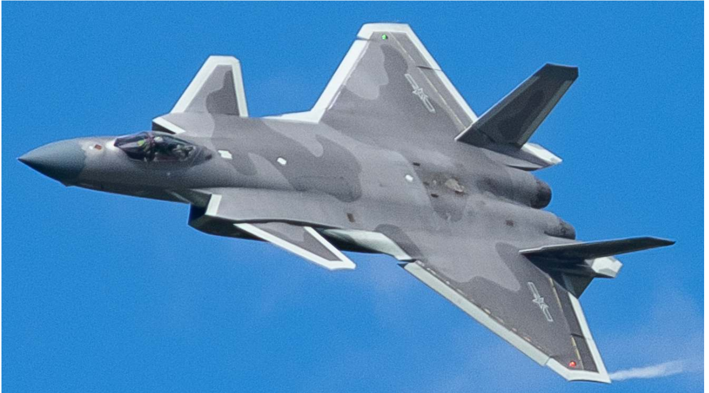
Figure 16: Image of J-20: "The Chengdu J-20 is China's first stealth fighter, first flying in 2011 and has already entered large scale production, with almost 100 being built each year"

Only looking at the decreasing numbers of jets in the US arsenal or plummeting readiness is just half of the picture. From China's point of view, the good side. But it is an inherent strength of the Western systems to allow criticism and a pluralism of opinions. It does, however, lead us to the risk of thinking the grass is always greener on the other side, when your neighbor has erected a tall fence around his yard and holds a gun to the head of anyone who dares to speak about how he cuts his grass poorly or what an unreliable sprinkler system he is using. This situation of suppression of dissenting opinions, the inability to criticize and a lack of agency within the officer corps persists in most dictatorships and has a significant impact on military effectiveness, staying hidden until war exposes it quickly and with brutal consequences. Examples can be found everywhere in history, from the deficiencies within the Soviet army that have continued into "modern" Russia and