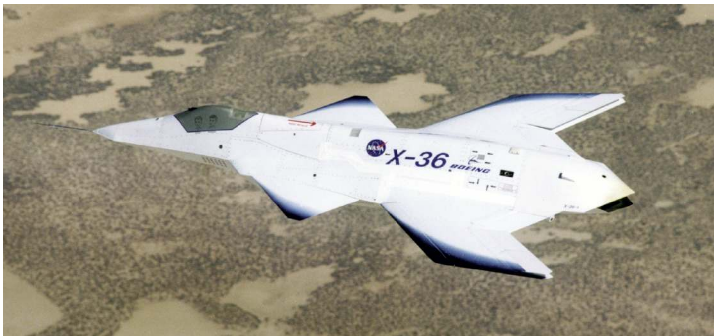
Figure 7: Image of X-36: "The X-36 Tailless Fighter Agility Research Aircraft, a 28% scale test aircraft, in flight, now part of the exhibit at the National Museum of the USAF in Dayton, Ohio"

design was also entirely tailless, using the canards, coupled with thrust vectoring to achieve the desired flight characteristics without vertical stabilizers. With McDonnell Douglas merging with Boeing in the same year, the X-36 may give us at least a little glimpse of what to expect of the F-47, although it must be said that stealth technology has changed a lot in the almost 30 years since then (Stewart, 2024).