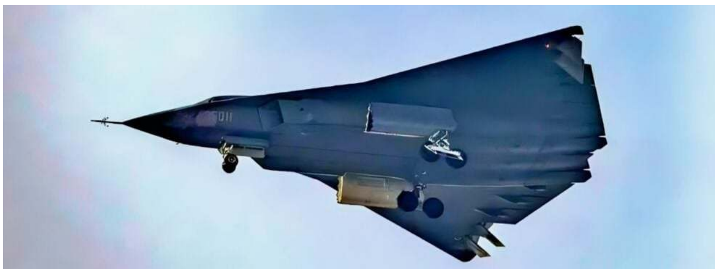
Figure 5: Image of Chengdu J-36: "The Chengdu J-36 observed on one of its purposefully poorly hidden test flights"

US air-to-air missiles like the AIM-260 JATM, as they are vital for its air dominance role in the Pacific. According to USAF General David Allvin, X-plane demonstrators specific to the F-47 programs have been flying since 2019 (Binkov, 2025a). We can therefore expect an accelerated timeline for the program, enabling a pre-production prototype to take flight by 2028, before the end of the Trump Presidency (Aldeghi, 2025d). The first jets may roll off the production line by 2032. This might still put the program behind the timeline of the Chinese J-36, a presumed 6th Gen stealth fighter, as the first J-36 prototype seems to have taken flight in December of 2024 (Wegener, 2025b).