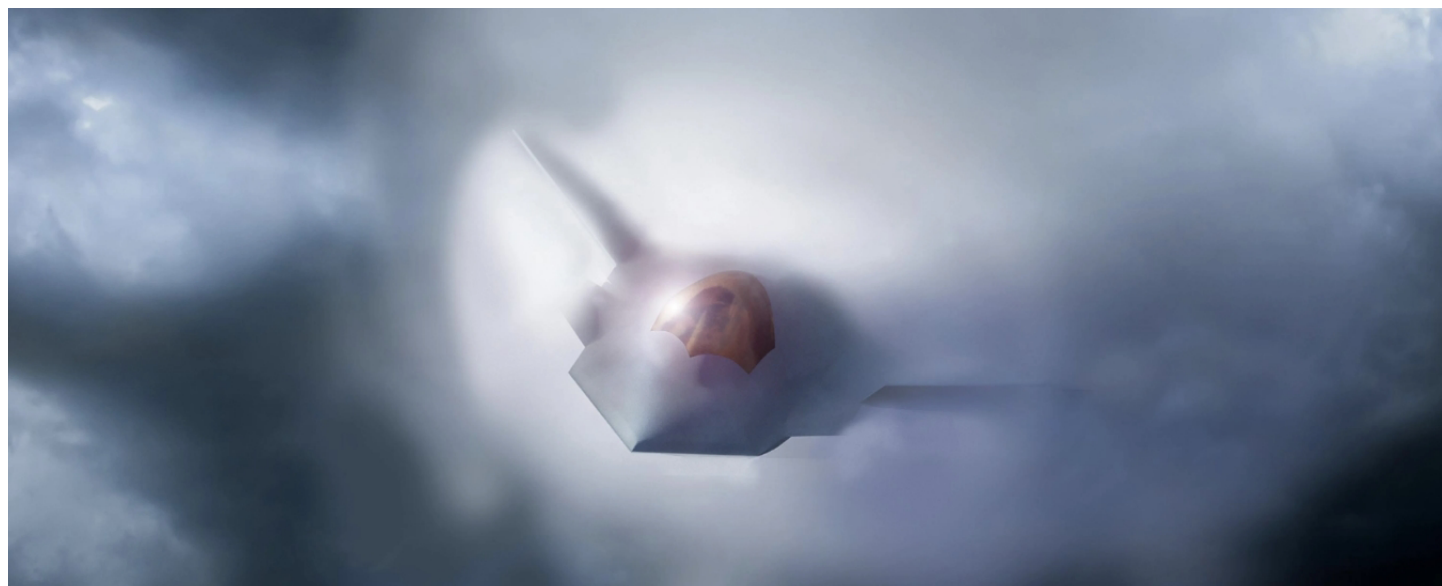
Figure 2: Image of F47 "Rendering of the F-47, as envisioned by an artist"

First things first: We don't know that much. We especially don't know as much about the F-47 as we think we know. So, what do we know?