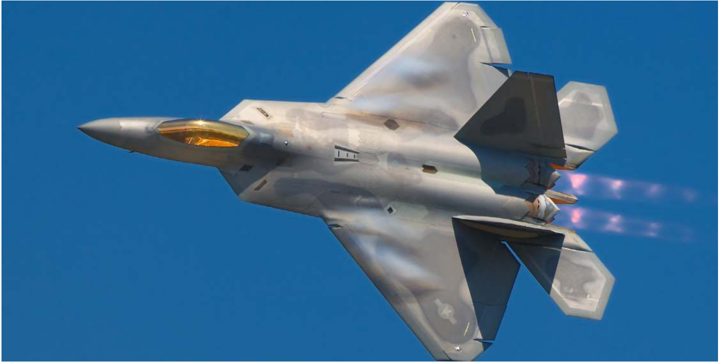
Figure 4: Image of F-22 Raptor: “The F-22 Raptor was deemed so advanced that a congressional act was passed into law to prohibit its sale even to the closest US allies”