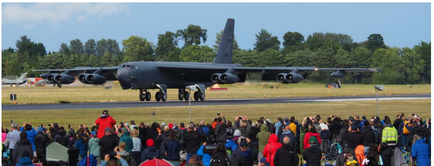
Figure 1: Image of B52 at RIAT: "A B-52H landing at the RIAT airshow in the UK, the specific aircraft pictured was built in 1961, photograph by Ferdinand Wegener"