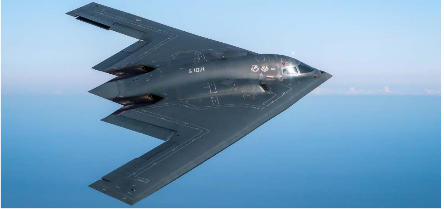
Figure 11: Image of B-2 Spirit in flight: “The B-2 Spirit is seen as the spiritual predecessor of the B-21 Raider”

Some have dubbed the B-21 the “B-2.1”, a reference to the B-21 just being a slightly improved B-2 (Aldeghi, 2025e) 3 . But, that is not even close to true. While not an aviation revolution that the B-2 was and the F-47 aims to become, the B-21 is still a substantial evolution of an entirely new plane, based upon the sound design ideas of the B-2, far from a mere “upgrade”.