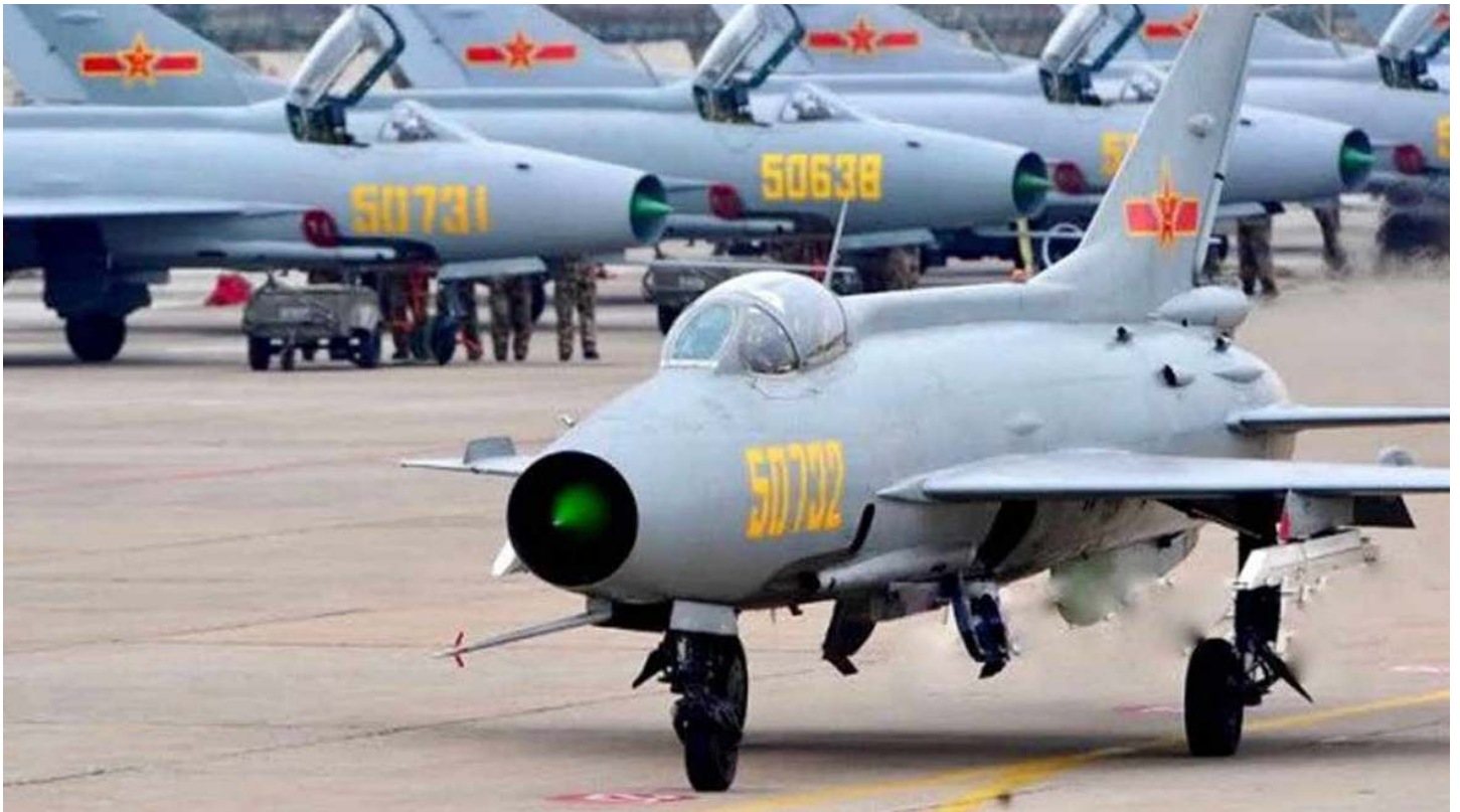
Figure 17: Image of J-7: “The Chengdu J-7 with the fitting NATO reporting name “fishcan” first flew in 1965 and, apart from China, is still in service with airpower giants like Bangladesh, North Korea and Zimbabwe”

So, if we think about what Chinese challenges the F-47 and B-21 might face in the future, we must not forget what challenges China itself faces.