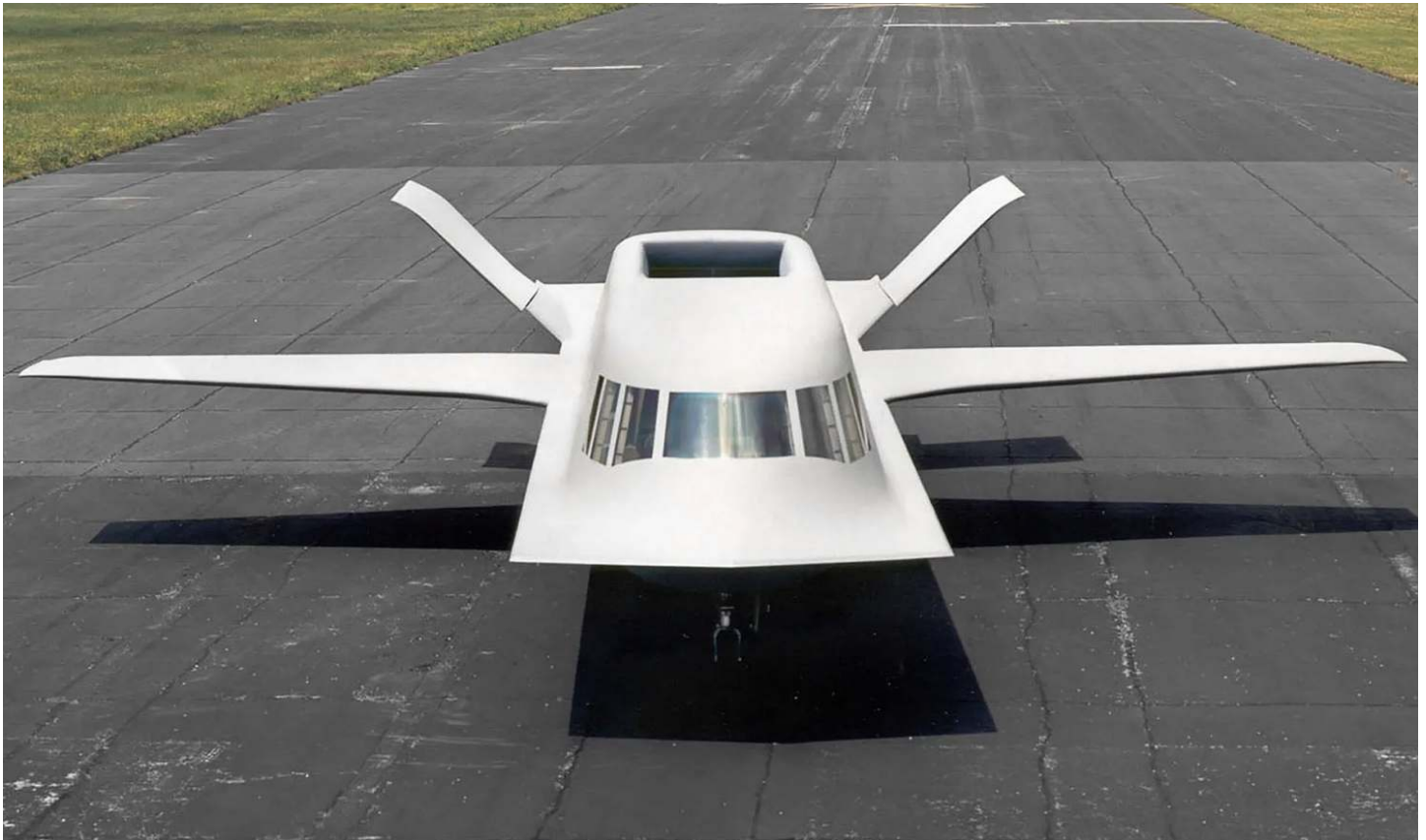
Figure 14: Image of Tacit Blue: "The advancements in stealth technology made with the Tacit Blue can still be observed in the lineage of the B-2 and B-21, as the setup and angle of the cockpit windows is a clear evolution of the Tacit Blue's design"

stealthy engine inlet and outlet shapes, being more akin to the B-2's angled design and less like the B-21 smooth air intakes. This suggests stealth characteristics lagging a generation behind the US designs. Other experts asserted that the cabin and fuselage are also much more blended into the wing on the B-21 than on the B-2, which, in conjunction with the intakes hidden into the wing, invites comparisons with the Northrop "Tacit Blue" stealth technology demonstrator (Binkov, 2022).