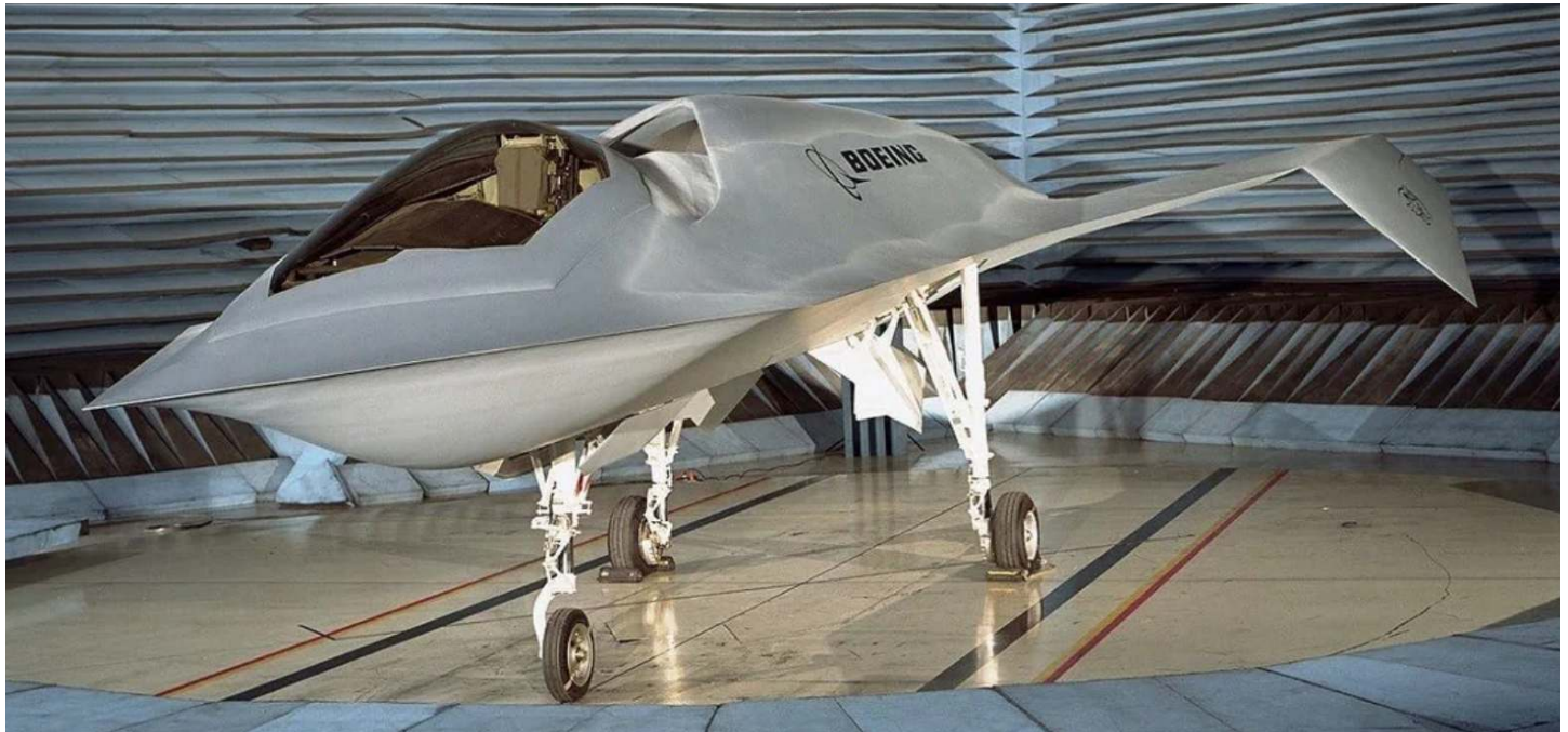
Figure 3: Image of Boeing Bird of Prey: "The Boeing Bird of Prey, now on display at the National Museum of the USAF in Dayton, Ohio"

beyond the capabilities of 5th Gen fighters like the F-35 and F-22, and that it will likely have the features most associated with the evolving definition of the 6th Gen moniker, chief among them all-aspect stealth. According to President Trump, an experimental version of the plane has been flying for almost five years. This probably doesn't refer to a prototype F-47, but to technology demonstrators that paved the way for the F-47, akin to the Boeing Bird of Prey.