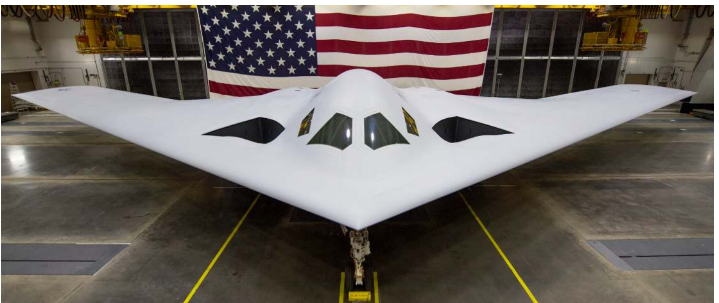
Figure 12: Image of B-21 Raider in hangar: “The B-21 evolves the concept of the B-2, taking the essence of what made the B-2 great and improving on every aspect of it”

The biggest improvement over the B-2 seems minor at first. Not only is the effectiveness of the RAM (radar absorbing material) coating increased, but also its durability. According to USAF generals and NG execs, this results in a higher cycle aircraft, meaning it can fly every day, unlike the B-2 which needs extensive maintenance for its radar absorbing material coating after every sortie (Binkov, 2022).