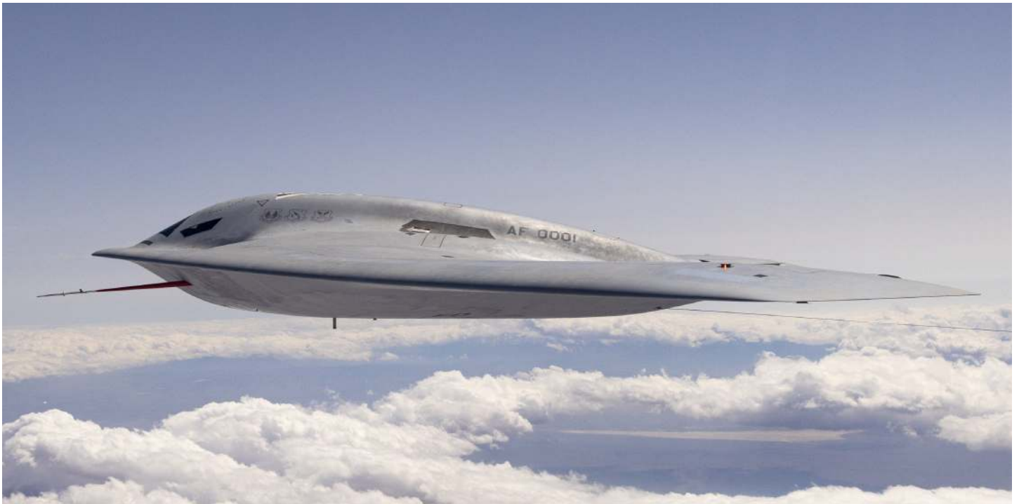
Figure 18: Image of B-21 during test flight: "A B-21 prototype photographed during a test flight in 2024"

Therefore, giving a conclusive answer to the question this essay poses in its headline is impossible. But you probably knew that before you started reading it. And if you didn't, I at least got you read it. The impact of the F-47 and B-21 in the Pacific will have to be assessed and re-assessed over and over again, as their success depends on too many factors for an easy, one and done conclusion. What we can say is that they follow different but sound design approaches and promise to be cutting-edge machines at the top of their respective class, giving the US both the most capable fighter and bomber in the World.