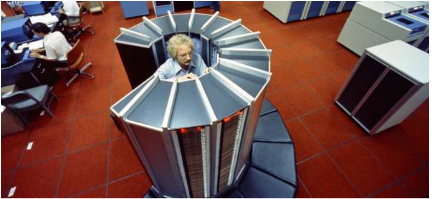
Figure 8: "A picture of a variant of the Cray-1 supercomputer in use at the University Corporation for Atmospheric Research (UCAR) in Boulder, Colorado"

Firstly, we discussed the engines of the F-47, The variable flow engines of the F-47 present both an enormous engineering challenge to master and a tremendous achievement in engine design, if successful, according to Prof. Wegener. The introduction of a variable flow engine on a production aircraft would be a US quantum leap far surpassing Chinese engine technology in his view. This is echoed by Chinese struggles to develop suitable engines for their current and future aircraft fleet, resorting to using copies of imported Russian designs instead of domestic designs, having to compromise on reduced thrust output of indigenous engines or even using an unusual three engine layout on its new J-36 prototype. Concerning the switch from the resident stealth fighter expert Lockheed Martin (F-35 A, B, C and F-22) to first time stealth fighter manufacturer Boeing, Prof. Wegener judges this as a smart strategic move to foster competition. Unlike countries like China and Russia, who rely almost entirely on single, specialized design bureaus for specific aircraft types like Chengdu for all Chinese and Sukhoi for all Russian stealth fighters, the US had a different approach. Even after the consolidation phase of aircraft manufacturers into fewer, bigger conglomerates following the end of the Cold War, the US made sure to keep at least two companies in competitions in each sector of interest. By keeping