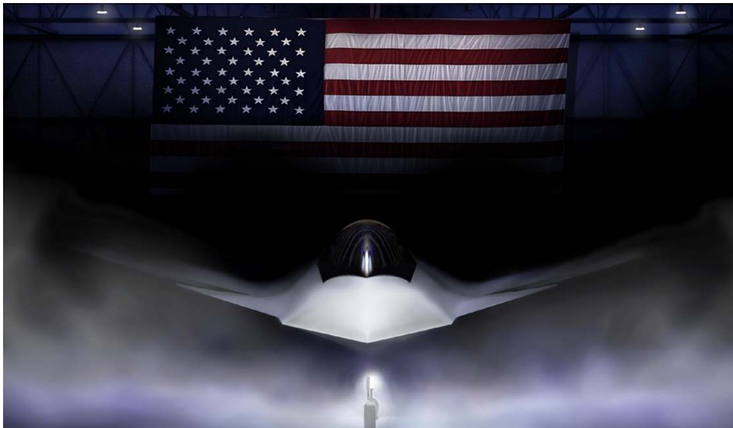
Figure 6: Artists rendering of F47: "Another artist's rendering of the F-47"

models of the plane or that they have just had the aircraft or its features described to them and they used their creativity to fill in the blanks and create an image. This most definitely does not mean that they had access to a top-secret prototype (if one were to exist) or the accompanying schematics. So, to a high degree, they are as in the dark about the F-47 as we are.