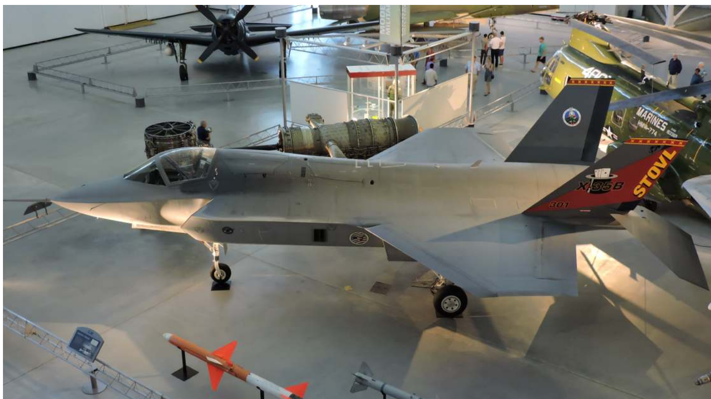
Figure 9: Image of X-35: "The X-35B prototype on display at the National Air and Space Museum, Virginia, photograph by Ferdinand Wegener"

What happened to the numbers between F-35 and F-47? The public hasn't heard much of the X-plane numbers after the X-35 was chosen to become the F-35, but in reality, the number of X-planes already goes up to X-66, at least as far as they are declassified.