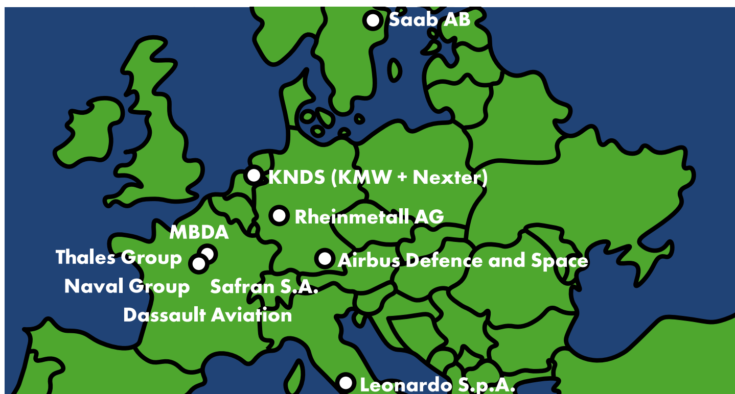
Figure 1: Map of Europe that indicates the headquarters locations of the 10 biggest defense industry companies.

Valley in the United States (Juhász et al., 2024). Many of the key breakthrough innovations of the Silicon Valley, such as the internet or GPS, were enabled by the US Defense Advanced Research Projects Agency (DARPA), which is a military research institution that operates based on a mission-oriented approach to innovation. A European example that could serve as an important innovative ecosystem is the Munich area in Germany. Today, this area already combines the strengths of world-class research institutions, such as the Max Planck Institute, strong academic institutions with the Technical University of Munich and global industry players, such as Airbus Defense and BMW. In addition, several innovative defense startups, such as Helsing, have established themselves in the Munich area. Airbus Defense and Helsing are both very likely to significantly profit from an increase in public defense R&D. This infusion of capital into the innovative ecosystem must be leveraged to maximise the benefit from the innovative spillover effects that can be generated between these different institutions. Innovation through Defense Spending Compared to Traditional R&D Support. It could be argued that funnelling R&D investments through defense spending is an unnecessary detour, when it would be possible to directly increase the budget of public research institutions or financially incentivise