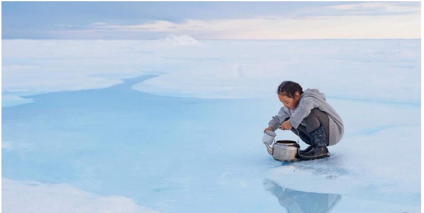
Figure 2: Inuit traditions in a warming Arctic (Johnson, 2019)

through these terms the original colonizers created a new web of meanings opposed to traditional Inuit ones which they then used to enhance their claims to the far north.