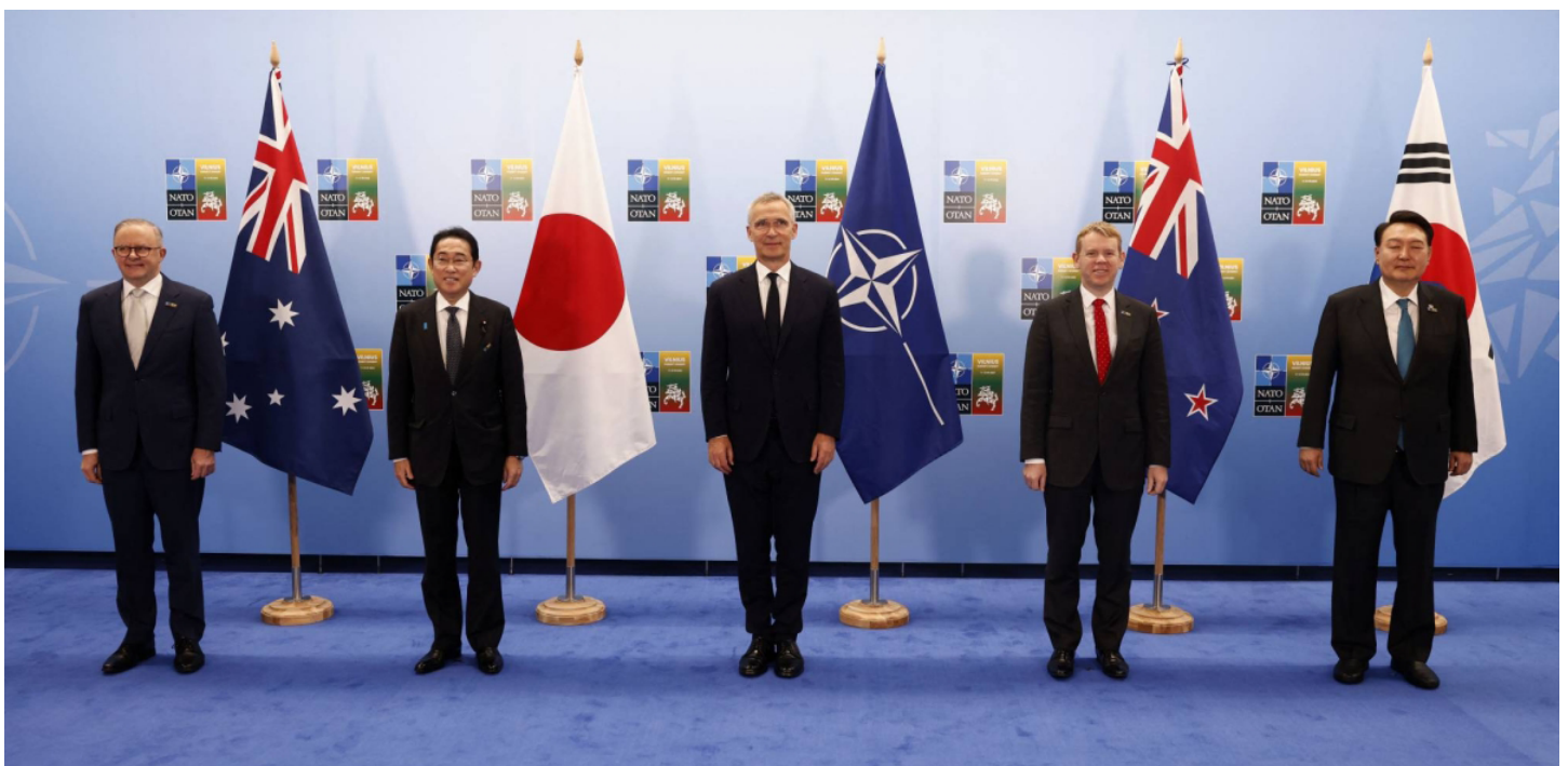
Figure 1: https://www.japantimes.co.jp/commentary/2024/10/29/japan/nato-ip4-europe-indo-pacific-security/

Recent years have thus seen a surge in concrete and diversified collaboration, as: