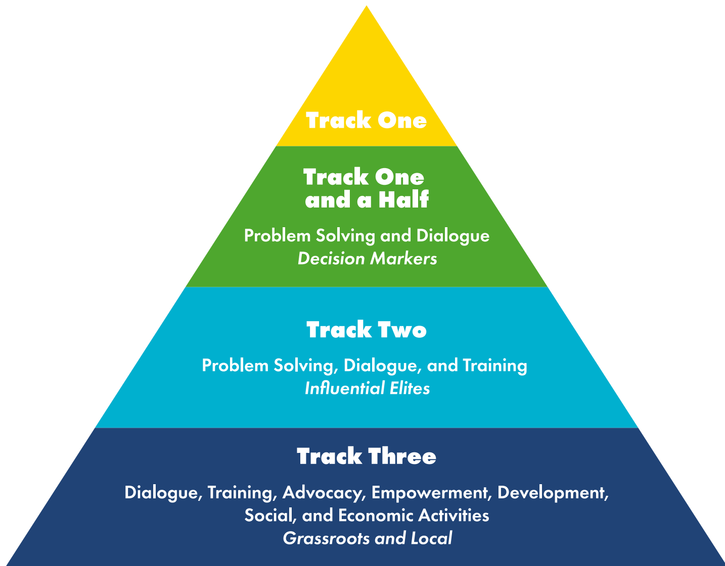
Figure 1: Adaptation of the Lederach's pyramid by Jones et al. (2025)

All these tracks can come into play at different stages of negotiation and in different grades of formalization. Especially Track Two and Track One and a Half can be found in various forms. It reaches from the beginning and the opening of dialogue, even before there is a formal process to broaden the scope of the negotiation by bringing in more actors. But it also includes various steps in between like keeping dialogue open, while official forms are stuck or frozen, or providing a space for detailed work that is not in the agenda of official actors (Jones et al. 2025). Coming from this differentiation, in the following more specific cases will be assessed that exemplify what non-state actors can really do within this framework. By positioning the actors on this scale, it is not predetermined what activities they can offer. These reach from providing platforms or being an informal negotiator to outreach through hybrid hubs and governance networks.