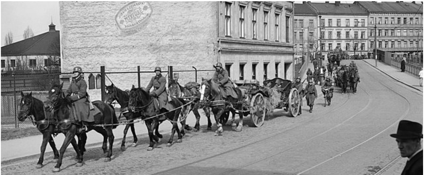
Figure 3: German forces pull 10.5cm howitzers on horseback in occupied Norway, 1940. Although trucks would have been a much more efficient transport for artillery, horses were often in more abundant supply than either trucks or their fuel.

the survivability lens oversimplifies the battlefield into a narrow, game-like mentality. Warfare is not a rock-paper-scissors match wherein the existence of gaps in specifications and capabilities of certain weapons systems leads to catastrophically one-sided engagements. This may prove difficult in an era of pervasive social media that provides the user with an unprecedented access to both battlefield information and their political representatives. Some private citizens, influenced by public online debates, even directly affect the outcome of national budget proposals (Gold et al., 2024). Musk and his like-minded colleagues are certainly far from being authoritative experts on military affairs, but they might still have a wide public audience and access to key government actors. Some might even be investors in emerging miltech and Silicon Valley darling firms like Anduril, which sells drone prototypes to the US Department of Defence, and thus have clandestine motivations to influence the distribution of billions of dollars in military contracts. Regardless, individuals with access to the internet are now privy to a wealth of readily available open-source information that intelligence agencies once expended a tremendous