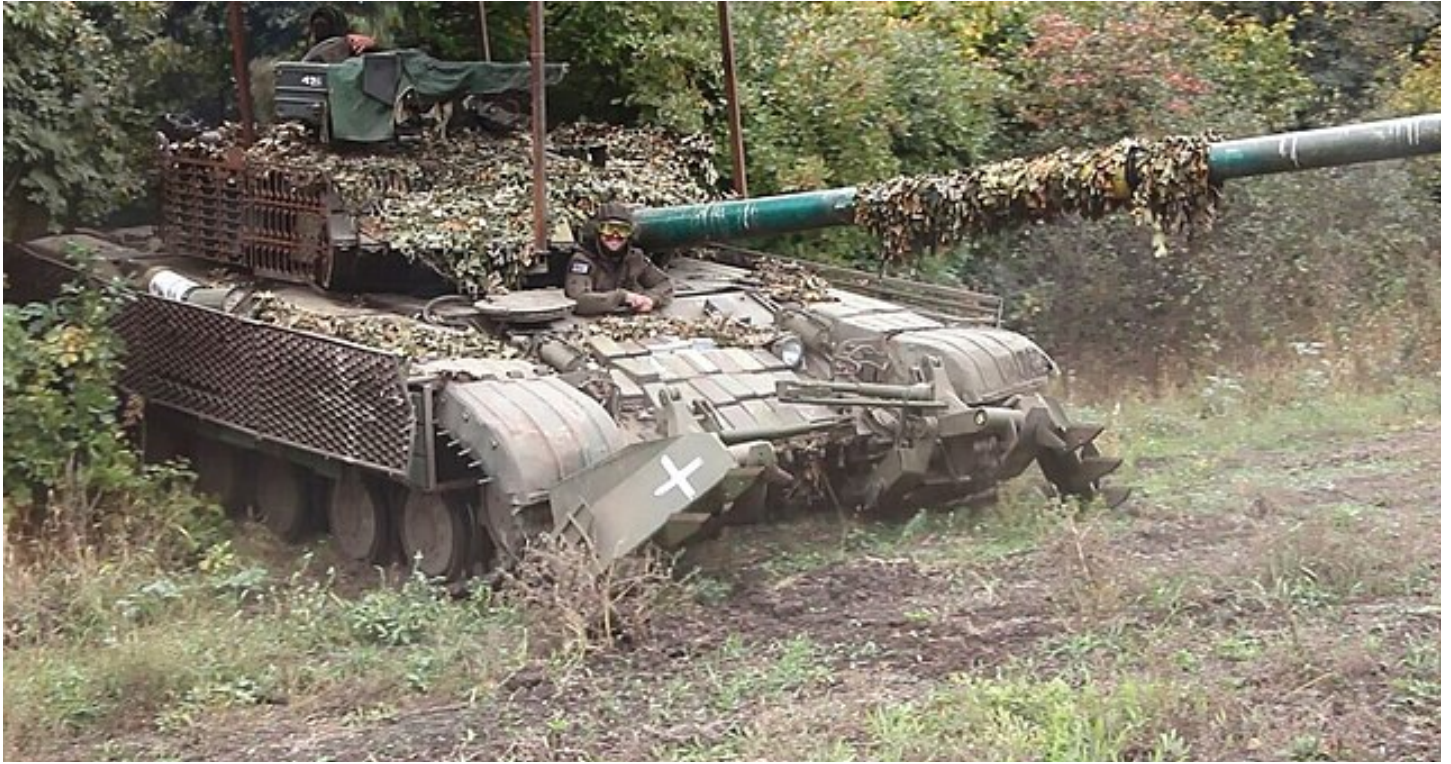
Figure 1: Despite the proliferation of drones, tanks like this Ukrainian T-64 have opted for improvised protective cages rather than disappear from frontline combat altogether. АрміяInform, CC 4.0

the wealthier knights could equip themselves in full armour suits that were virtually impenetrable to the crossbows and the guns of the time. Later, the proliferation and evolution of gunpowder weapons left chainmail and metal armour—for those that could afford it—helpless against projectiles. As armies nationalised and began fielding their infantry in regular uniforms absent any substantial protection, the essential vulnerability of the infantryman was acquiesced to by modernising militaries around the world. With the development and spread of shell artillery, this vulnerability has become horrifically acute over time. Infantry increasingly avoid direct combat with each other because their primary threat is now the artillery. During the American Civil War, around 12% of casualties came from artillery (McIntire, 2022), and in the First World War, the war of the ‘big guns’ pounding troops trapped in trenches, that figure rose to over sixty percent (Jones, 2016). In the battlefields of Ukraine, however, every four out of five casualties (Watling, 2024) came from artillery fires. Casualties among infantry are not only expected but even incorporated into strategies of relative attrition (Gady & Kofman, 2024). Infantry are less survivable than ever, yet are no less relevant than they have ever been.