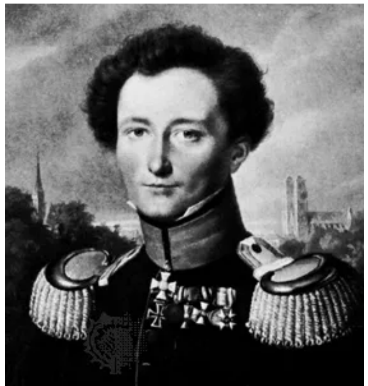
Figure 1: Carl von Clausewitz 1780-1831

Following Clausewitz's analysis of the nature of war, war will continue to be a continuation of politics by other means. It will also continue to be an act of violence in order to force the opponent to fulfill one's own will. Uncertainty, chance and friction, as well as psychological and moral factors, will continue to play a decisive role in the future and thus make war impossible to be calculated mathematically. Last but not least, war will continue to be more a matter for the defender than the aggressor. After all, it is only with the defense that the battle begins and with it the war. The "peace-loving" aggressor, Clausewitz refers in this context to Napoleon Bonaparte's self-portrayal, generally wants to conquer, dictate or unilaterally use force, but not necessarily fight. It is therefore particularly up to the defender to prepare for war.